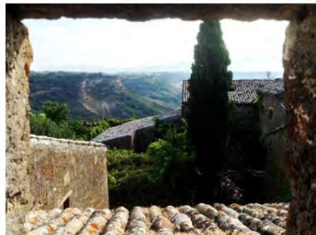
View to valley from upstairs window.