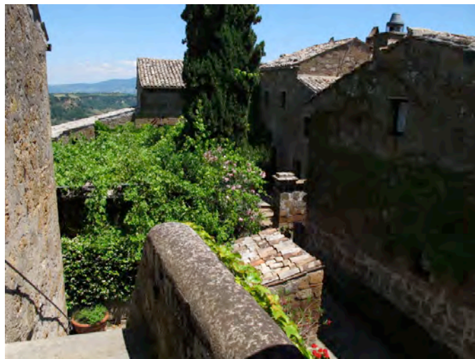
View from top of stairs at Il Ruderino and Nuovo.