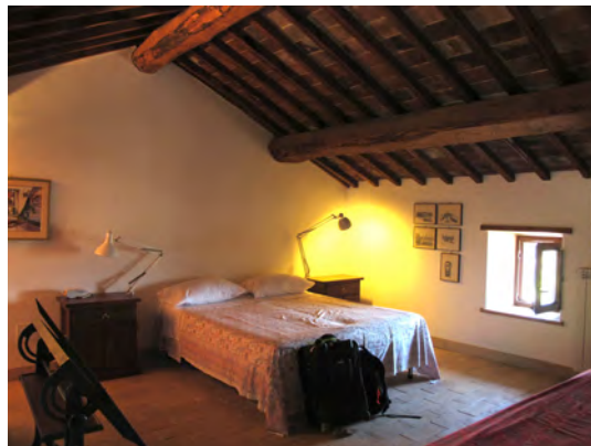
Upstairs bedroom can sleep 1-4.