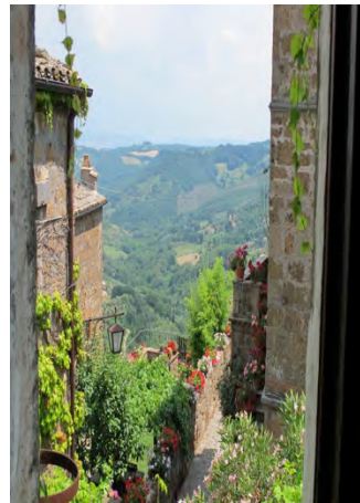
View from window.