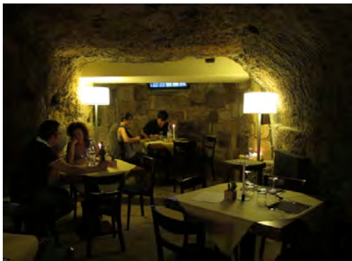
Dinner in the Etruscan cave at Alma Civita.