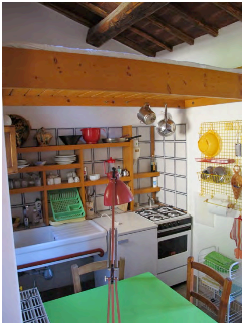
Ruderino kitchen and loft above.

Apartments have no air-conditioning, but the thick, stone walls remain cool, fans are available, and there are plenty of windows to catch valley breezes.