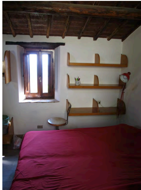
Two joined twin beds in studio apartment.