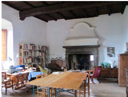
The Sala Grande—where we will meet and work indoors.