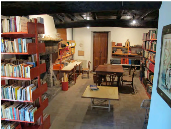
Ground floor Living Room/Studio work space.