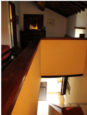
Two levels in Nuovo.