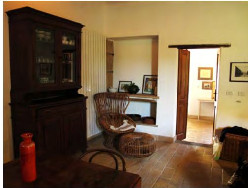
Beautiful modern kitchen and large table. Desk and shared entry beyond.