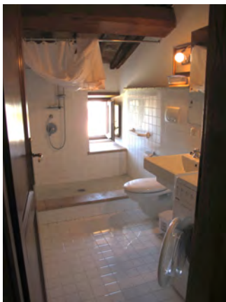
Upstairs bathroom w/washer.