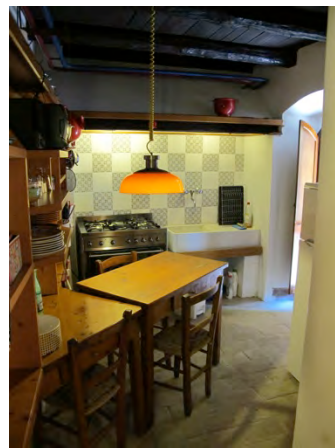
Ground floor kitchen.