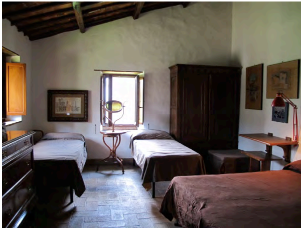
Upstairs Bedroom accommodates up to 5 people.

If you are willing to share lodging with other people, this apartment may be used for several guests in order to share space and reduce lodging costs. Let Stephanie know if you are interested in sharing Lo Studio with other workshop participants.