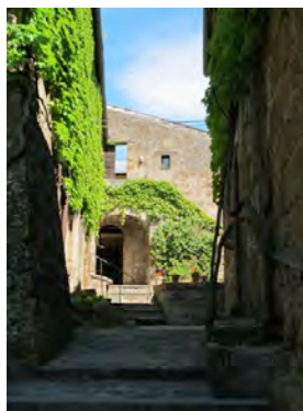
Lo Studio to the left, Il Nuovo and Ruderino up the stairs.

The Civita Institute* operates under NIAUSI (the Northwest Institute for Architecture and Urban Studies in Italy) and is a US 501.c.3 non-profit organization.