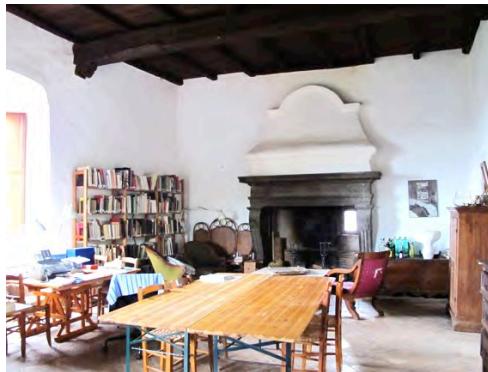
The Sala Grande—working indoors.