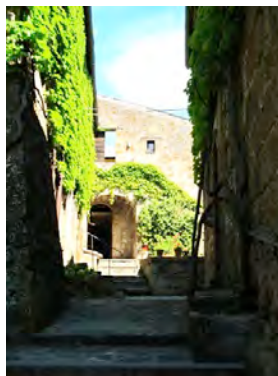
Lo Studio to the left, Il Nuovo and Ruderino up the stairs.

The Civita Institute* operates under NIAUSI (the Northwest Institute for Architecture and Urban Studies in Italy) and is a US 501.c.3 non-profit organization.