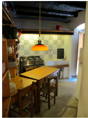
Ground floor kitchen.