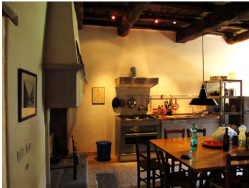
Beautiful modern kitchen and large table.

Upon your arrival, the kitchen will be stocked with grocery basics. Wi-Fi, and laundry facilities are included. Apartments have no air-conditioning, but the thick, stone walls remain cool.