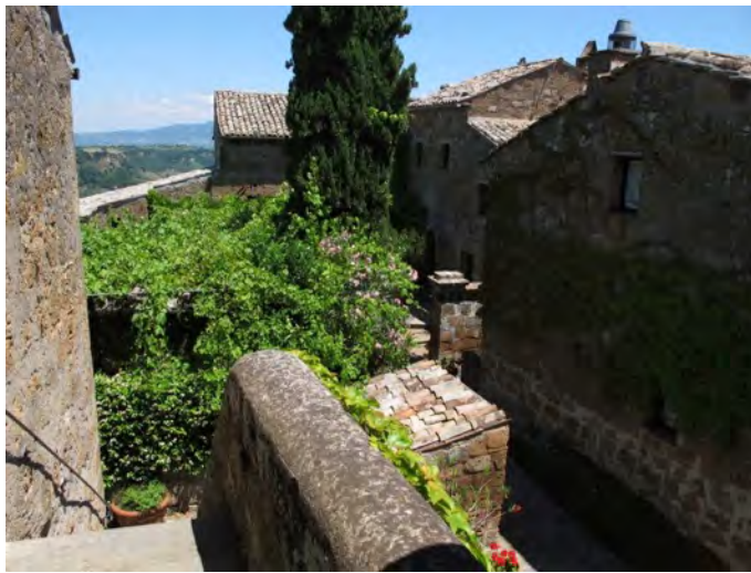
View from top of stairs at Il Ruderino and Nuovo.