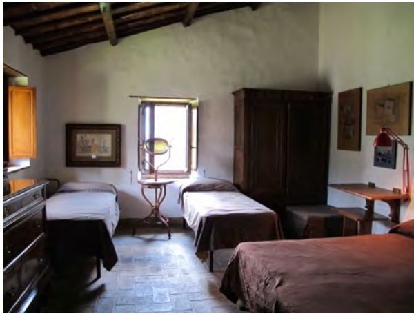
Upstairs Bedroom accommodates up to 4 people.

The Lo Studio apartment is a great option for solo women travelers willing to share space and reduce lodging costs. Let Stephanie know ASAP if you are interested in sharing Lo Studio with other workshop participants.