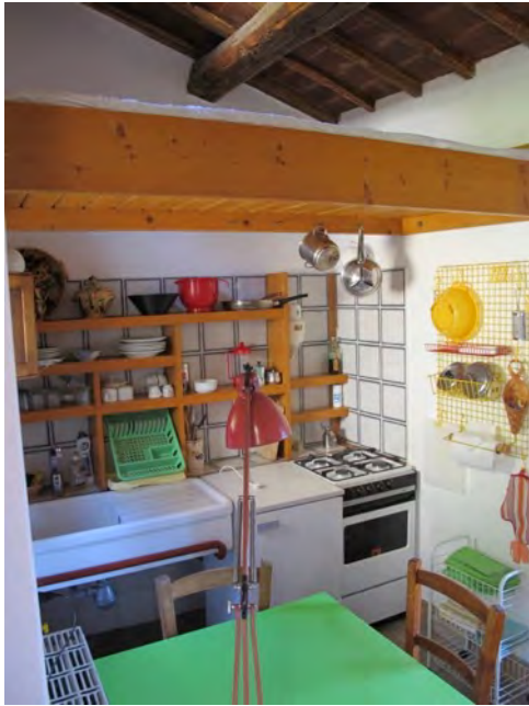
Ruderino kitchen and loft above.

Apartments have no air-conditioning, but the thick, stone walls remain cool, fans are available, and there are plenty of windows to catch valley breezes.