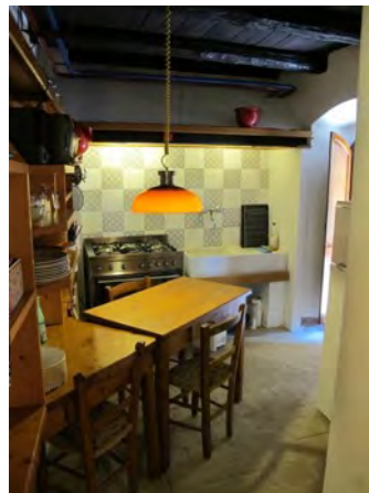
Ground floor kitchen.