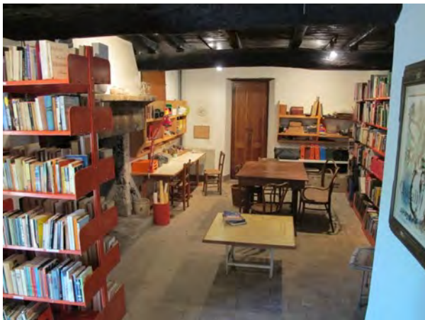
Ground floor Living Room/Studio work space.