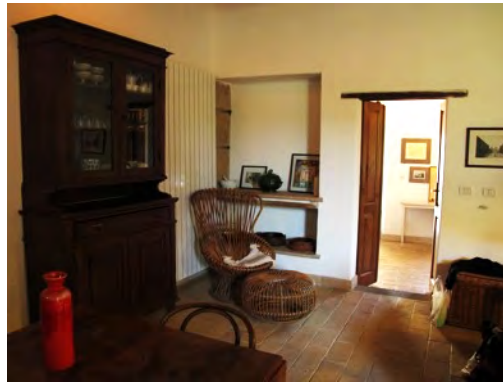
Desk and shared entry beyond.