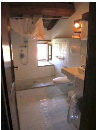
Upstairs bathroom w/washer.