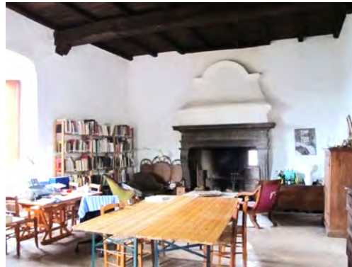
The Sala Grande—working indoors.