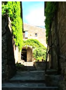
Lo Studio to the left, Il Nuovo and Ruderino up the stairs.

The Civita Institute* operates under NIAUSI (the Northwest Institute for Architecture and Urban Studies in Italy) and is a US 501.c.3 non-profit organization.