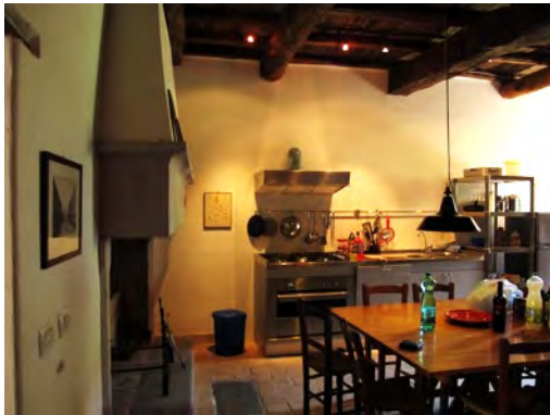
Beautiful modern kitchen and large table.

Upon your arrival, the kitchen will be stocked with some grocery basics. Wi-Fi, and laundry facilities are included. Apartments have no air-conditioning, but the thick, stone walls remain cool.