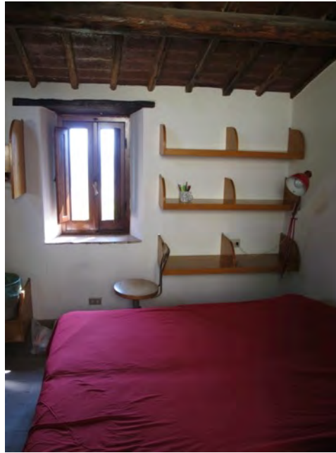
Two joined twin beds in studio apartment.