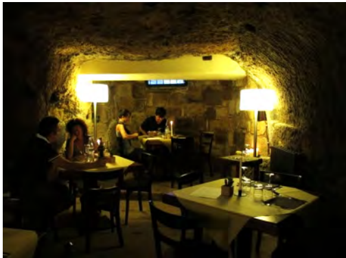
Restaurant Alma Civita's Etruscan cave.