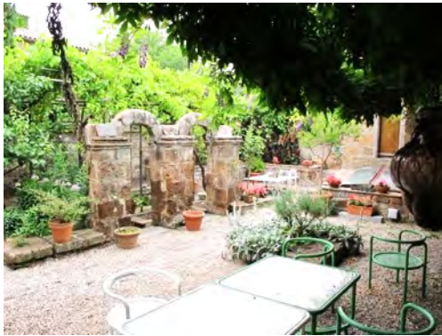
Garden for relaxing and group meals.

Apartments are reserved on a first come-first served basis , so contact Stephanie ASAP to reserve space!