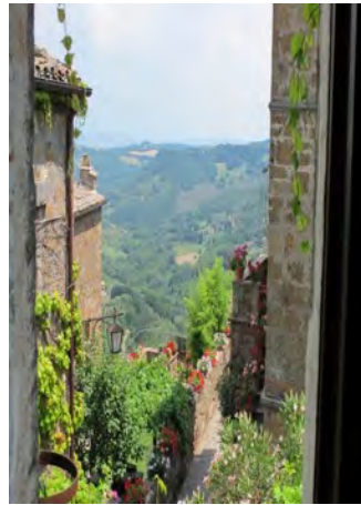
View from window.