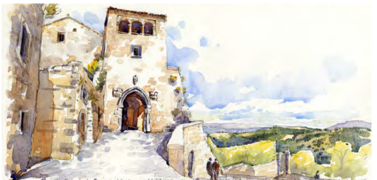
Porta Santa Maria, the entrance to Civita.

How to pronounce the name like a local? It's SHEE-vee-tah dee Bahnyo-rehj-oh